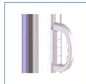
Pull hinge handle